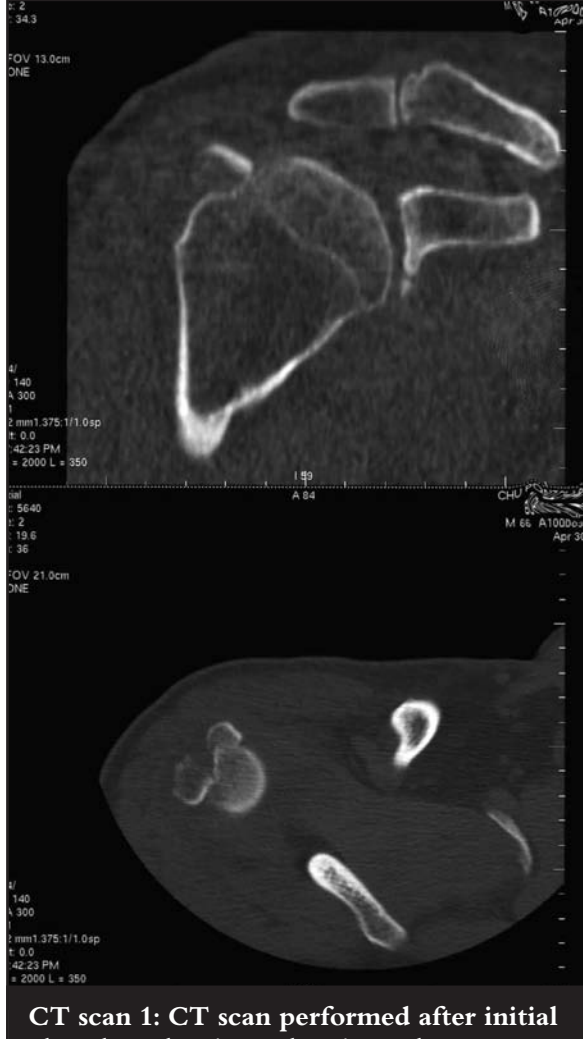
closed reduction showing the greater tuberosity fracture