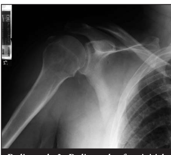
Radiograph 2: Radiograph after initial closed reduction (note the minimally displaced greater tuberosity fracture)